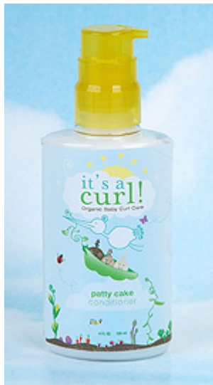
Patty Cake Conditioner

Peek-a-Boo Tearless Shampoo gently cleanses baby's hair and scalp with soothing botanicals. Suitable even for the most sensitive of skin. Only the Best For Your Precious Angel!