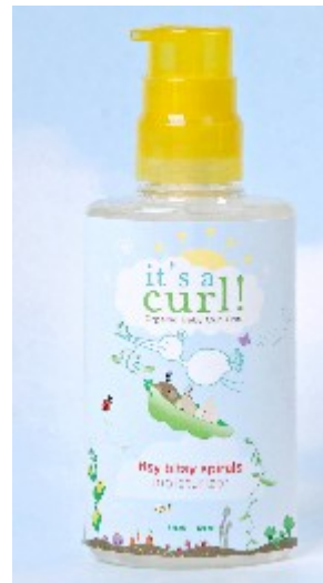
Itsy Bitsy Spirals Baby Curl Moisturizer