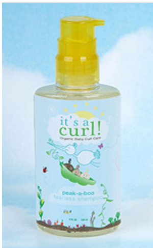
Peek-A-Boo Tearless Shampoo

Peek-a-Boo Tearless Shampoo gently cleanses baby's hair and scalp with soothing botanicals. Suitable even for the most sensitive of skin. Only the Best For Your Precious Angel!